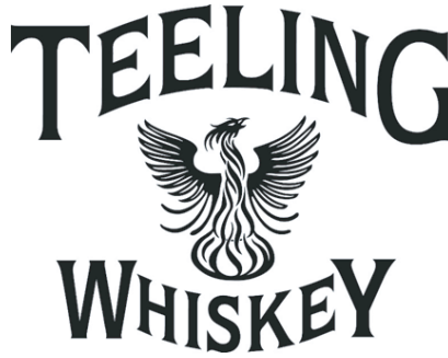
Figure 3. Teeling Whiskey Company Logo.