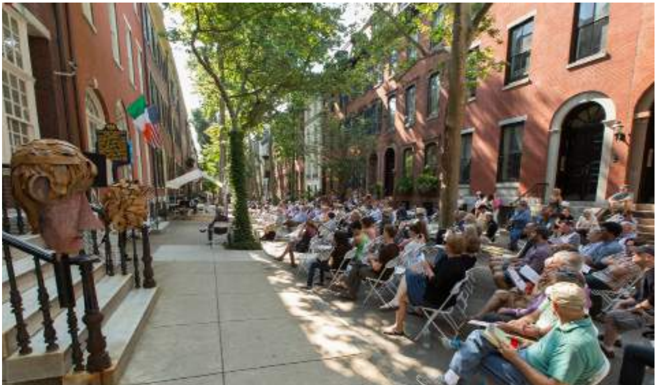
Bloomsday at the Rosenbach on Delancey Place.

Lauded as the greatest novel of all time, James Joyce's epic Ulysses tells the story of a day in the life of everyman Dubliner Leopold Bloom . The action of the story takes place on June 16, 1904, hence the selection of June 16 for Bloomsday, the annual international holiday celebrating Ulysses and its creator. As the home of Joyce's manuscript of the novel, the Rosenbach has observed Bloomsday in grand fashion for 25 years . We mark the occasion with a day-long, public reading of the novel, inviting international literati, local artists, and public figures to read on beautiful Delancey Place. The readings are accompanied by musical performances, and the combination of word and song brings the novel to exhilarating life in the open air. 🗝️